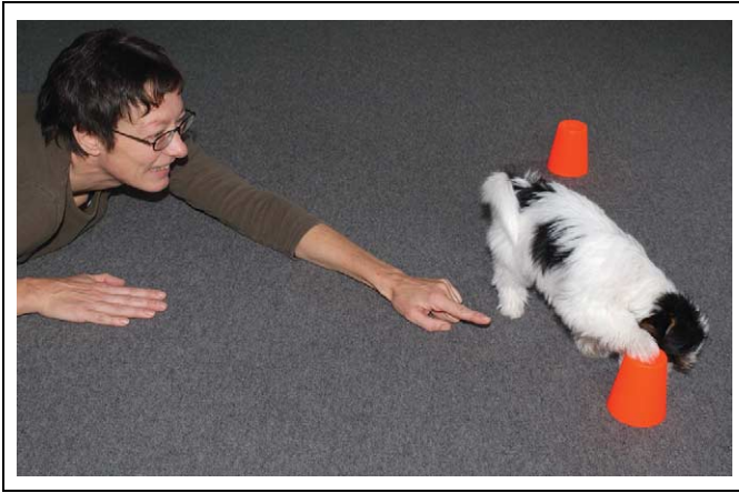
Figure 1. Dogs are more skilled than chimpanzees at using human behavioral cues (e.g. pointing) to find hidden food. In the basic test an experimenter places food so that the dog sitting across from her does not know in which cup it is hidden. Then the experimenter points in the direction of the correct cup and lets the dog choose a cup.

gazing to the target location (dog sees either the head turn or a static head looking towards a location); (iii) a human bowing or nodding to the target location; and (iv) a human placing a marker in front of the target location (a totally novel communicative cue). The dogs were even able to do the task correctly when the human walked towards the wrong container while pointing in the opposite direction to the correct container. In addition, dogs performed equally well whether cues were provided by conspecifics or humans. And in all of these cases, the dogs used the behaviors effectively from their very first trials, showing that they already possessed the required skills before the experiment. In many of these tests, over two-thirds of the dogs were significantly above chance as individuals.